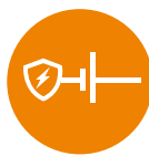
短路保护 Short Circuit Protection