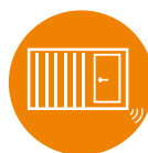
入侵检测系统 Intrusion Detect System