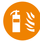
灭火系统 Fire Detection and Suppression