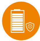
Rack级可视开关 Rack Level Lockable Disconnect