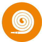
水消防系统 (可选) Water-based suppression System (Optional)